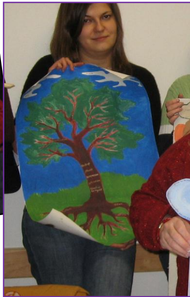
Adult Education, Sullivan, Maine